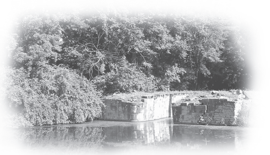
Lock on the Miami-Erie Canal near the Johnston Farm and Indian Agency in Piqua, Ohio. This lock helped control the flow of water to the canal that carried the Myaamia removal south to Cincinnati, Ohio.

On October 6th, 1846, hundreds of Myaamia were loaded onto three canal boats in Peru, Indiana – a place they called Iihkipihsinonki (the straight place, so named because of the unusually straight course of the Wabash River in that spot). From Iihkipihsinonki the canal boats were pulled along the Wabash-Erie Canal – the newly completed series of deep trenches and locks – and followed the Wabash north to Ft. Wayne.