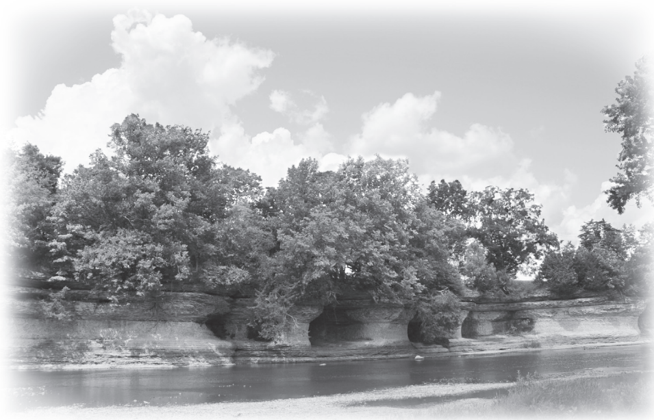
aašipehkwa waawaalici (Seven Pillars): located on the Mississinewa River east of Peru, Indiana, the Pillars are all that remain of limestone caves that were a popular spot to visit for generations of Myaamia people. Today, Seven Pillars remains popular and Myaamia people visit the site regularly.

For many Myaamia people, we often say that time is like a pond, and events are like stones dropped in water. Emotionally powerful events create big ripples that combine with the smaller ripples of less powerful events in unpredictable ways. In our Myaamia pond, the forced removal of 1846 was more like a boulder, which, once dropped into our lives, created a series of waves that changed everything. The political, economic, and cultural impacts of this forced relocation were immense, and the emotional toll of this experience has trickled downstream in the memories and stories of many Myaamia families. Removal remains an event that is painful for us to remember and discuss, but to choose to forget has never been an option. We know we must continue to remember in order to honor the sacrifices endured by our ancestors who made this terrible journey.