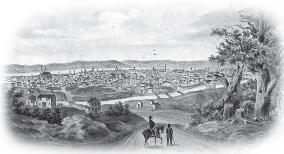
Cincinnati in 1841. This painting shows the canal as it appeared five years before removal. Today, this location lies in downtown Cincinnati, Ohio.

From Kiihkayonki, the five canal boats were pulled to the Miami-Erie canal and began a four-day journey south to Cincinnati, OH. On their way south the Myaamia passed numerous sites of great historical and cultural importance. They passed the site of Fort Defiance, the military bastion from which Anthony Wayne launched his final invasion into Myaamionki in 1794. They also passed Pinkwaawilenionki (Pickawillany) a prominent Myaamia village site in the mid-eighteenth century. Much of the Miami-Erie canal followed the course of the Ahsenisiipi (the Great Miami River); a river that originally was a major route of travel to their hunting grounds along the Ohio River and to their relatives who also called that beautiful place home.