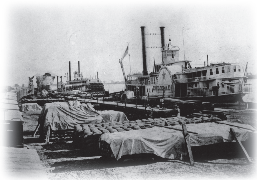
Steampacket Colorado. Our ancestors were loaded onto this steamship in Cincinnati, Ohio. It took them west along the Ohio River to Bloody Island across from St. Louis.

In Cincinnati, the Myaamia were moved to the steamship Colorado, and on October 12th the ship began its journey west on the Kaanseenseepiwi (Ohio River). After eight days of travel on the Colorado, they arrived in St. Louis, Missouri. The Myaamia were unloaded at Bloody Island, which lay in the middle of the Mississippi River. This location placed the group near the traditional village sites of their Inoka (Illinois) relatives and as such it was a place they knew well. However it was also at the western edge of Myaamionki. To the west lay the traditional homelands of groups that had formerly been their enemies; to their parents generation those western lands had been a dangerous place. Yet, the Americans told them these lands in the west were to be their new homes.