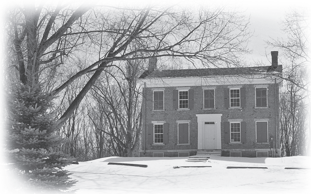
akima pinšiwa awiiki (home of Chief John Baptiste de Richardville): The house in this picture was built in 1827 for pinšiwa and was his home until his death in 1841. It is located just south of Fort Wayne, Indiana and is awaiting designation as a National Historic Landmark.

(To the Indian names are subjoined a mark and seal.)