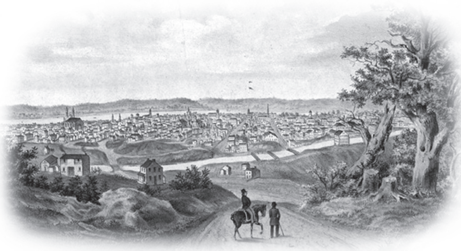
Cincinnati in 1841. This painting shows the canal as it appeared five years before removal. Today, this location lies in downtown Cincinnati, Ohio.

From Kiihkayonki, the five canal boats were pulled to the Miami-Erie canal and began a four-day journey south to Cincinnati, OH. On their way south the Myaamia passed numerous sites of great historical and cultural importance. They passed the site of Fort Defiance, the military bastion from which Anthony Wayne launched his final invasion into Myaamionki in 1794. They also passed Pinkwaawilenionki (Pickawillany) a prominent Myaamia village site in the mid-eighteenth century. Much of the Miami-Erie canal followed the course of the Ahsenisiipi (the Great Miami River); a river that originally was a major route of travel to their hunting grounds along the Ohio River and to their relatives who also called that beautiful place home.