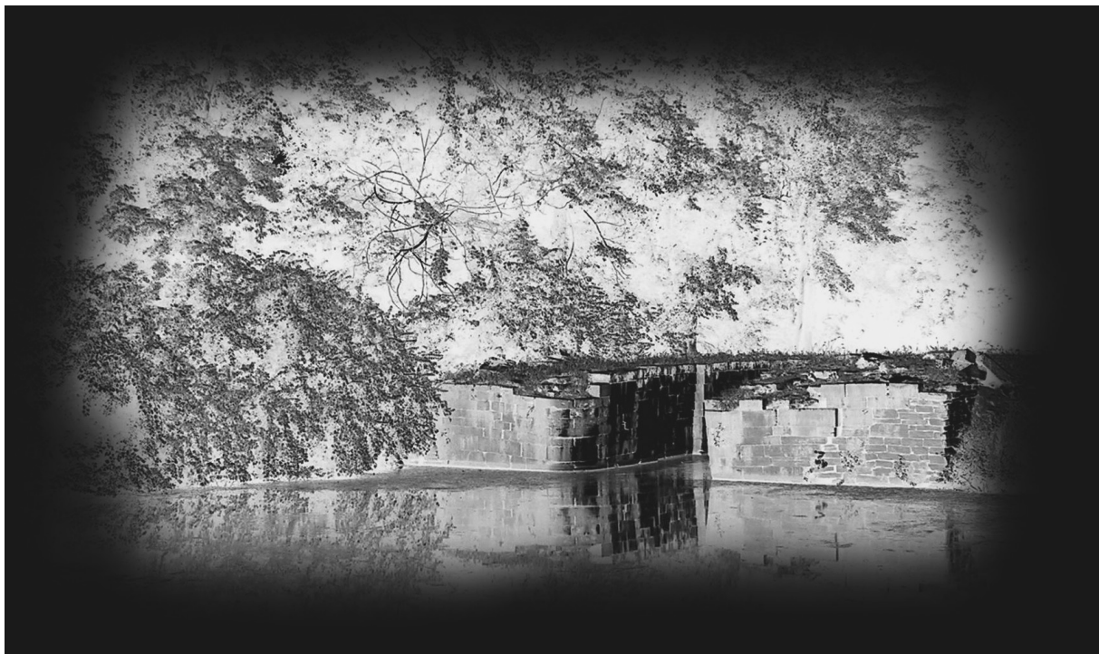
Lock on the Miami-Erie Canal near the Johnston Farm and Indian Agency in Piqua, Ohio. This lock helped control the flow of water to the canal that carried the Myaamia removal south to Cincinnati, Ohio.

On October 6th, 1846, hundreds of Myaamia were loaded onto three canal boats in Peru, Indiana – a place they called Iihkipihsinonki (the straight place, so named because of the unusually straight course of the Wabash River in that spot). From Iihkipihsinonki the canal boats were pulled along the Wabash-Erie Canal – the newly completed series of deep trenches and locks – and followed the Wabash north to Ft. Wayne.