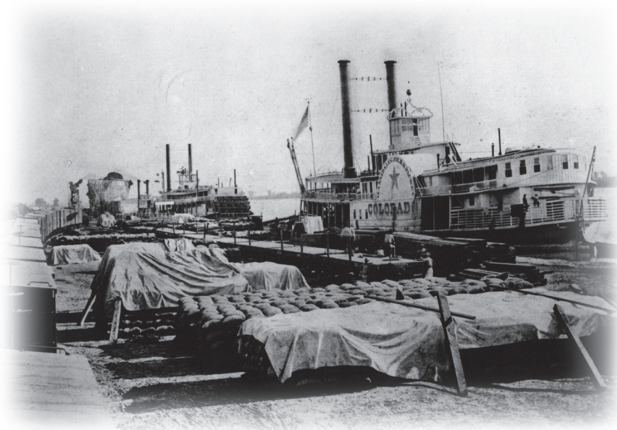
Steampacket Colorado. Our ancestors were loaded onto this steamship in Cincinnati, Ohio. It took them west along the Ohio River to Bloody Island across from St. Louis.

In Cincinnati, the Myaamia were moved to the steamship Colorado, and on October 12th the ship began its journey west on the Kaanseenseepiwi (Ohio River). After eight days of travel on the Colorado, they arrived in St. Louis, Missouri. The Myaamia were unloaded at Bloody Island, which lay in the middle of the Mississippi River. This location placed the group near the traditional village sites of their Inoka (Illinois) relatives and as such it was a place they knew well. However it was also at the western edge of Myaamionki. To the west lay the traditional homelands of groups that had formerly been their enemies; to their parents generation those western lands had been a dangerous place. Yet, the Americans told them these lands in the west were to be their new homes.